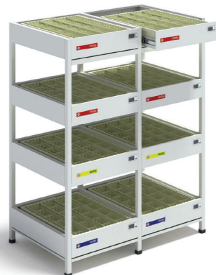
SZ-SR04S 915 × 560 × 1160