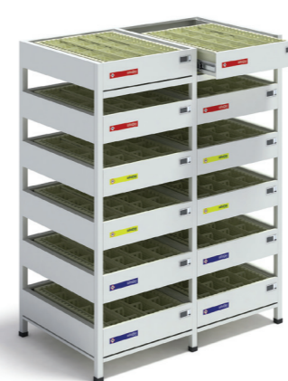
SZ-SR06S 915 × 560 × 1160