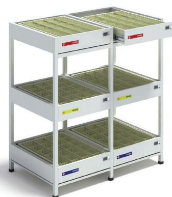
SZ-SR03S 915 × 560 × 1160