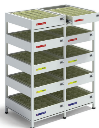
SZ-SR05S 915 × 560 × 1160