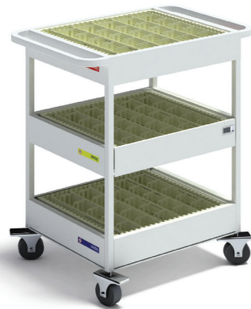
SZ-SH03S 490 × 556 × 900