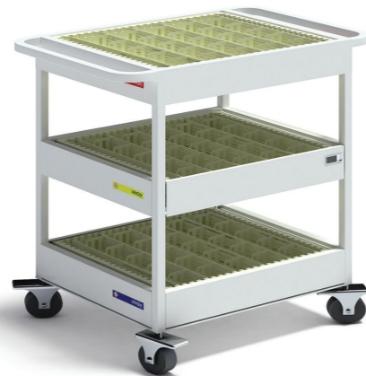
SZ-SH03L 640 × 555 × 900