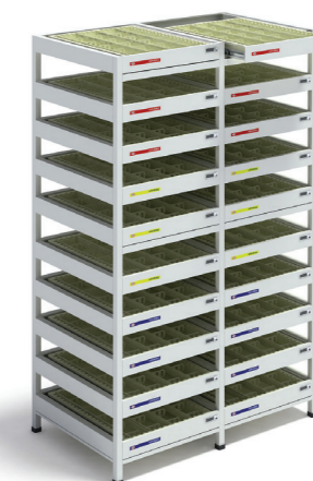
SZ-SR10 995 × 560 × 1500